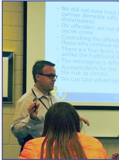
Presentation at HPPD site visit